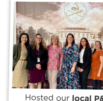
Hosted our local P&C's in Parliament, and provided $250 bike vouchers .