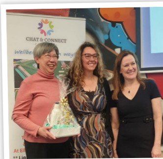
Supported Ellenbrook Chat & Connect... celebrating 2 years!