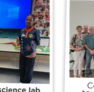
Committed $3.5 million towards a new Ellenbrook Community Hub .