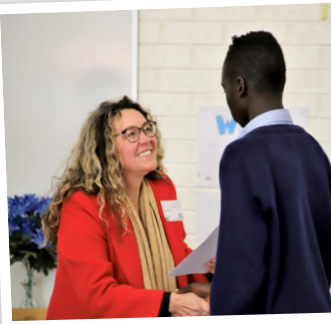
Sponsored the 'Mentor Me Reconnect' program at Holy Cross College .