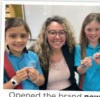
Opened the brand new science lab at Ellen Stirling Primary School , with new equipment.