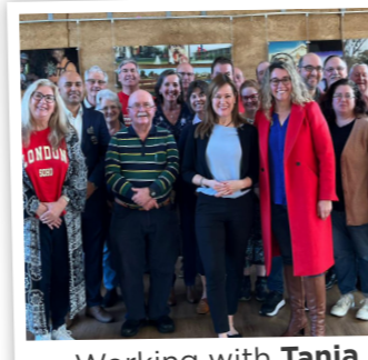
Working with Tania Lawrence, MP for Hasluck , to deliver for Swan Hills!