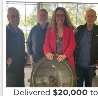
Delivered $20,000 to Bullsbrook Museum for a shed fit-out and upgrades.