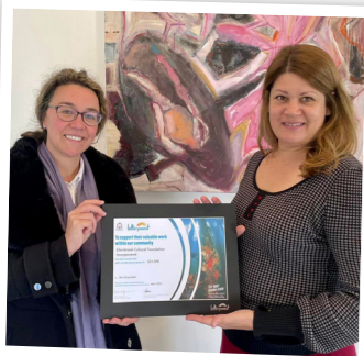
Supported Ellenbrook Arts and sponsored the Youth Prize .