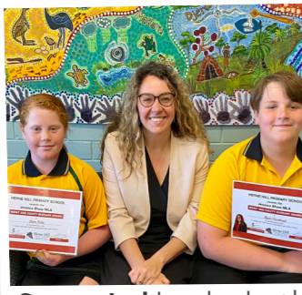
Supported local schools with a Merit & Equity Bursary across Swan Hills.